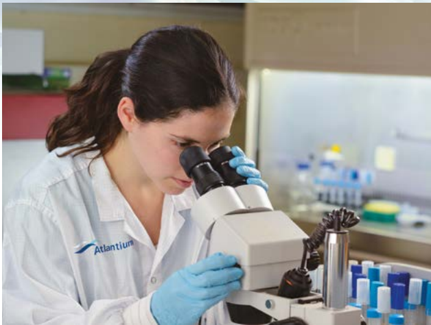
Atlantium microbiologist examines water specimen

An engineering study compared Atlantium Medium Pressure UV for 4-log virus credit with chemical and other treatments: UV can win! Ask us for a copy!