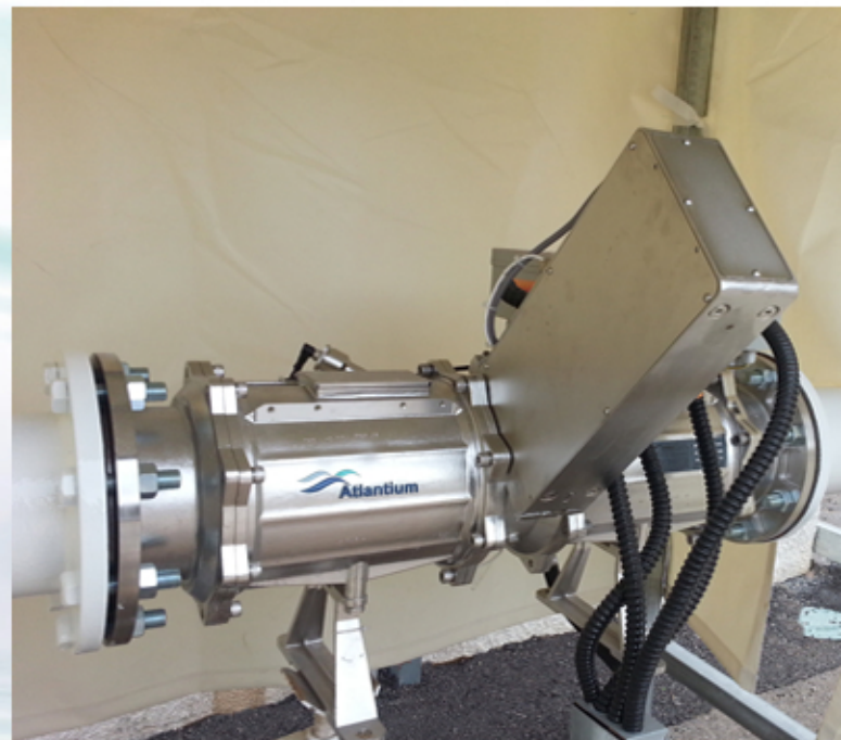
Atlantium UV municipal installation with Deposit Prevention Mechanism attachment. The automatic cleaning system keeps the quartz tube deposit-free

Atlantium support starts at the beginning and goes on. Five years later, after a severe storm flooded the Village (2013) and damaged the municipal water infrastructure, Atlantium pulled out all the stops to get another unit on-site and installed immediately, even before the Municipality emergency funding was approved. Atlantium commitment to service and support continues.