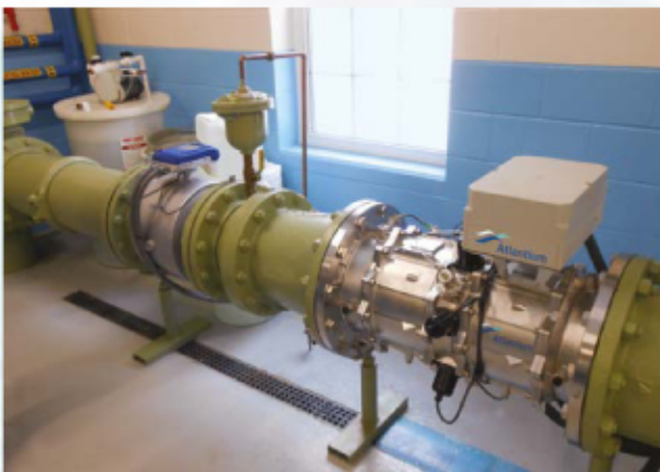
Atlantium easy-to-maintain UV system disinfects the drinking water for a small public water system in Massachusetts

Validated Atlantium Medium Pressure UV can provide the dose you need at lower energy.